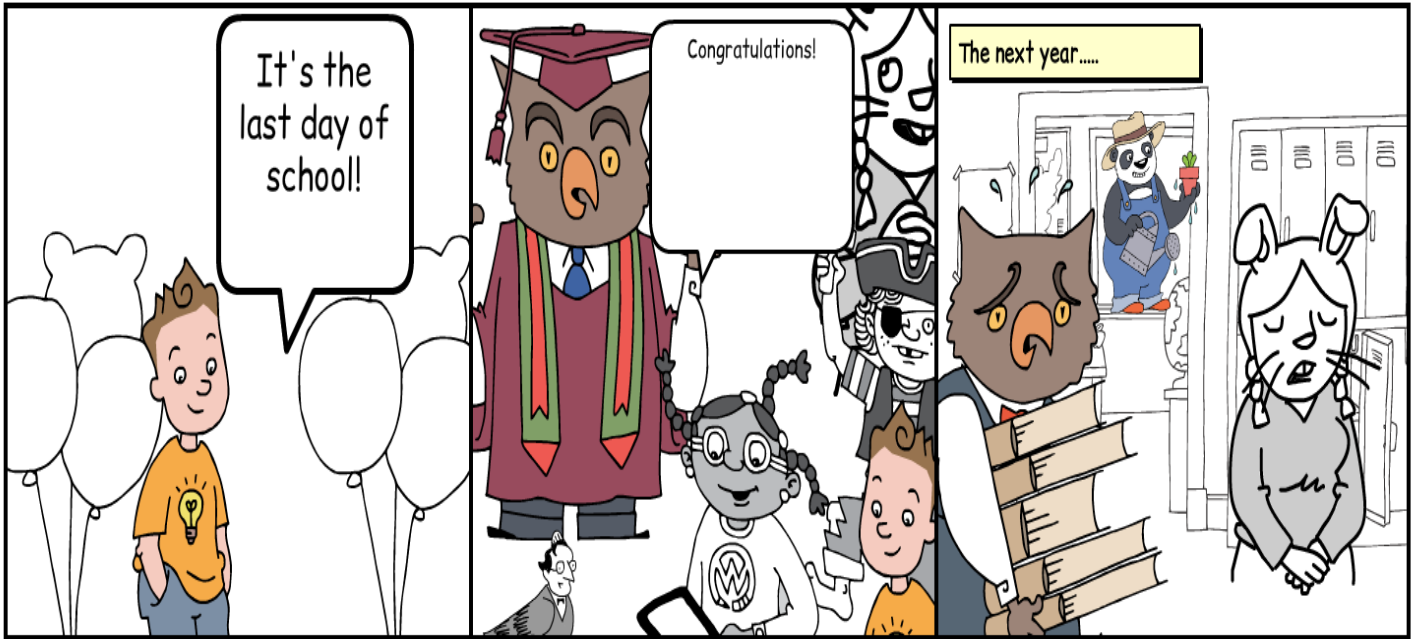
This comic strip was created at MakeBeliefsComix.com . Go there to make one yourself!